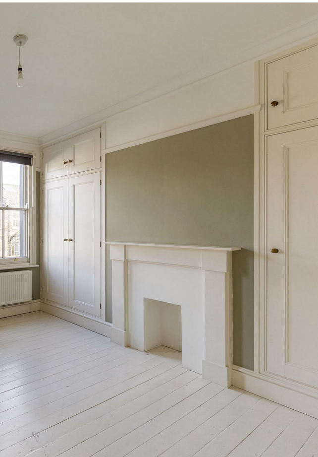
Study 8'2" x 6'0"