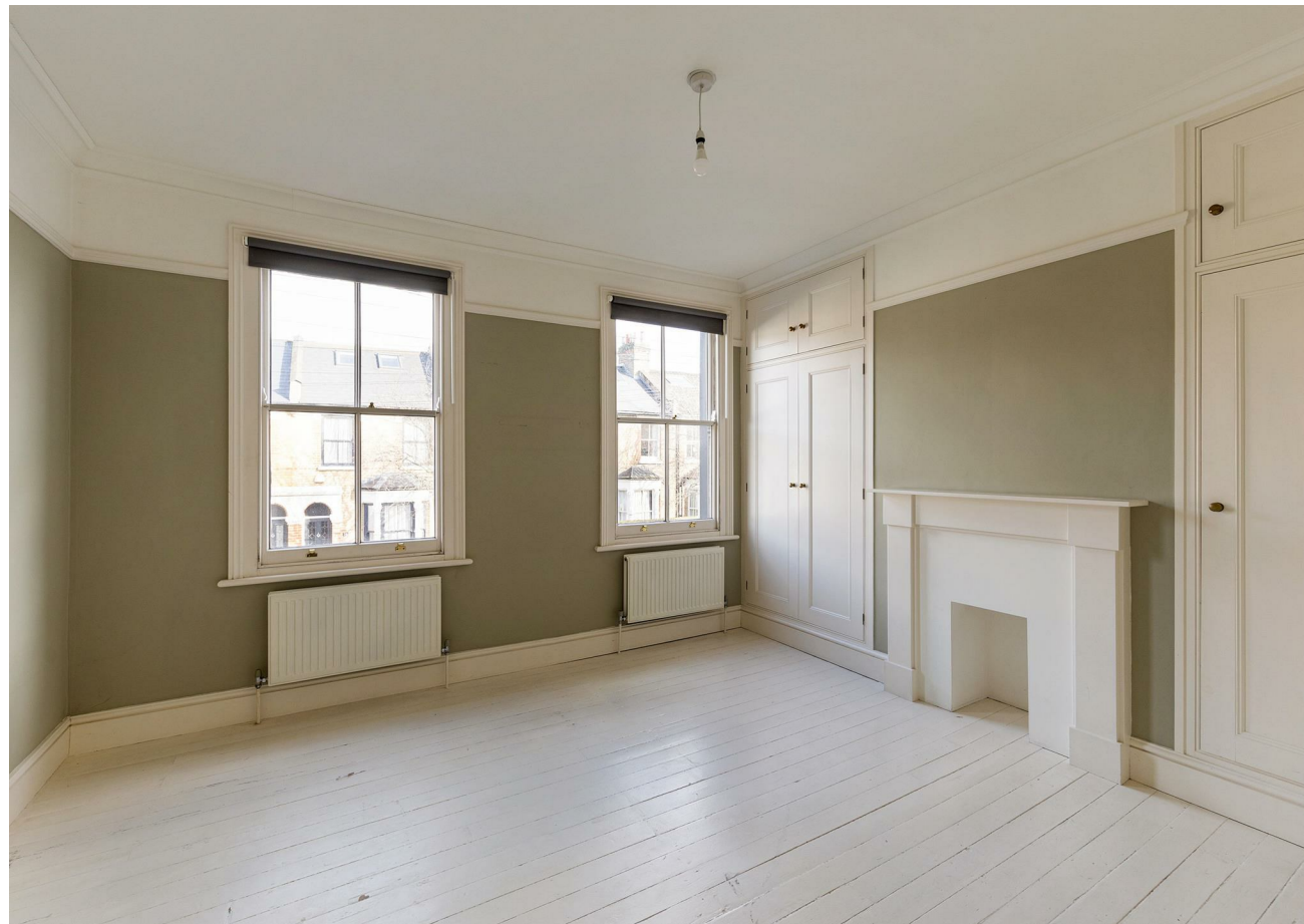
Reception Room 25'8" x 10'5"